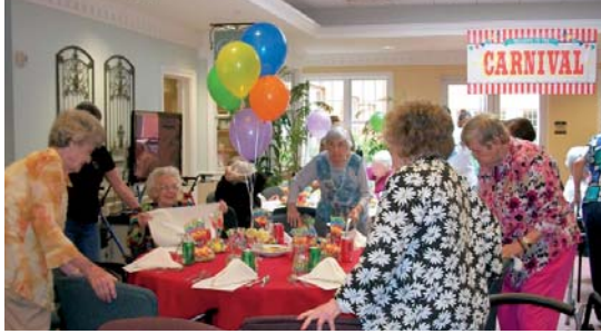
The ladies arrive at Carnival