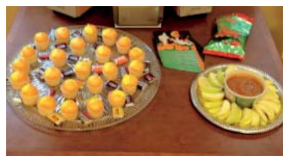
No Tricks, Just Treats - 2015 style