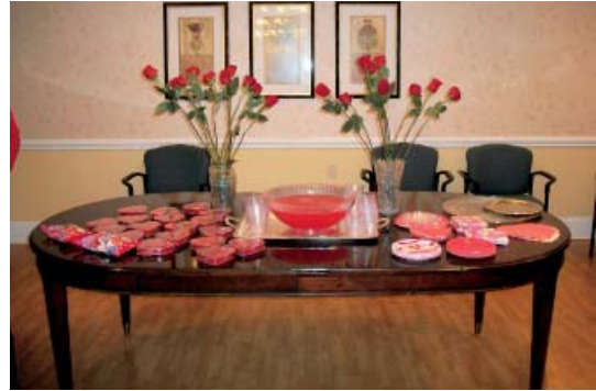
Roses are Red