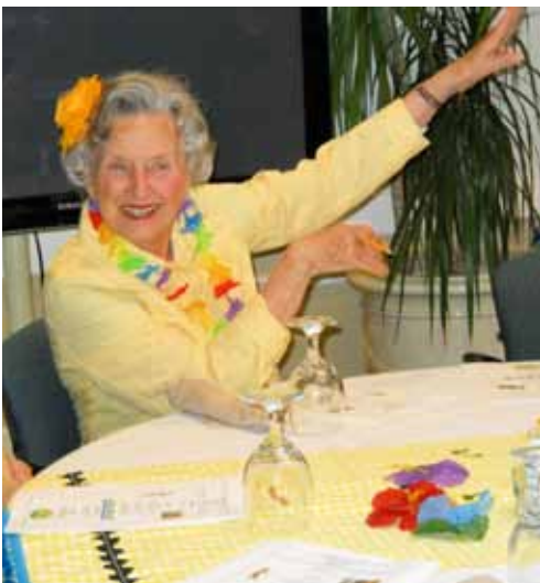
Enjoying the Trezevant Terrace luau.