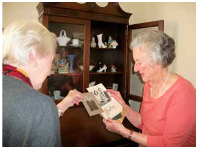
Looking at family pictures.