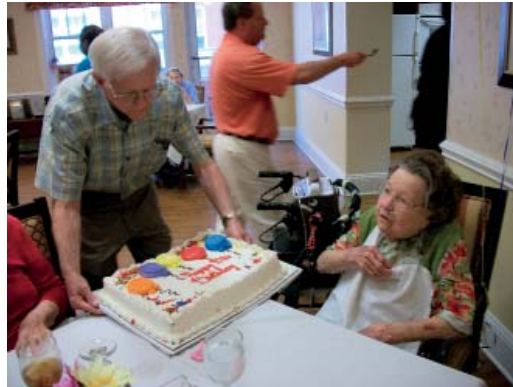
The Birthday Cake