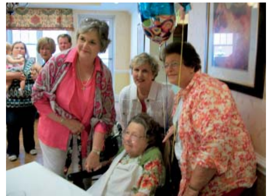
More photos with the birthday girl