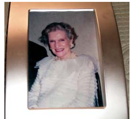
Still glamorous in her eighties